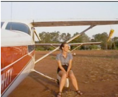
Monika's Mighty Ity Cessna 172